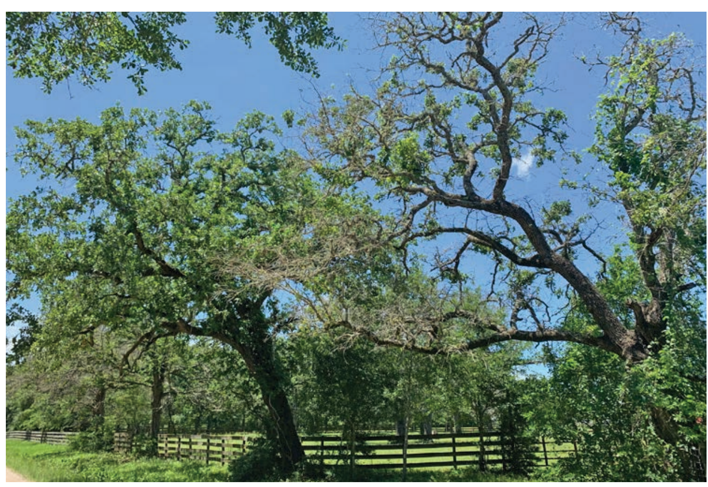
This year's historic winter storm event, combined with stressors from previous years, has caused some mature oaks to struggle after their budding-out process was disrupted by the deep freeze.