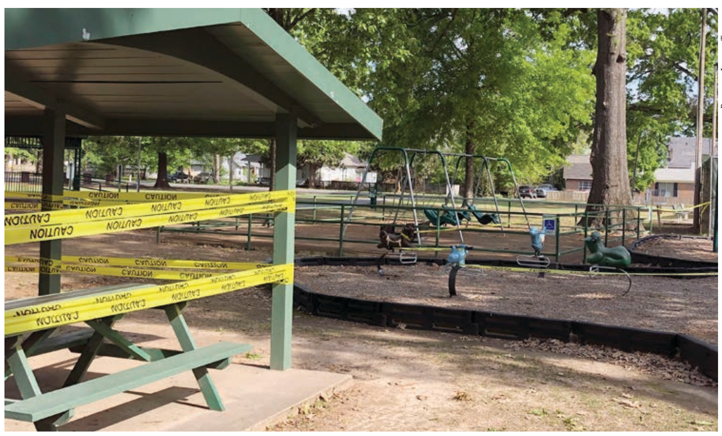
A "black swan" event, such as COVID-19, can do the impossible, like close our city parks.