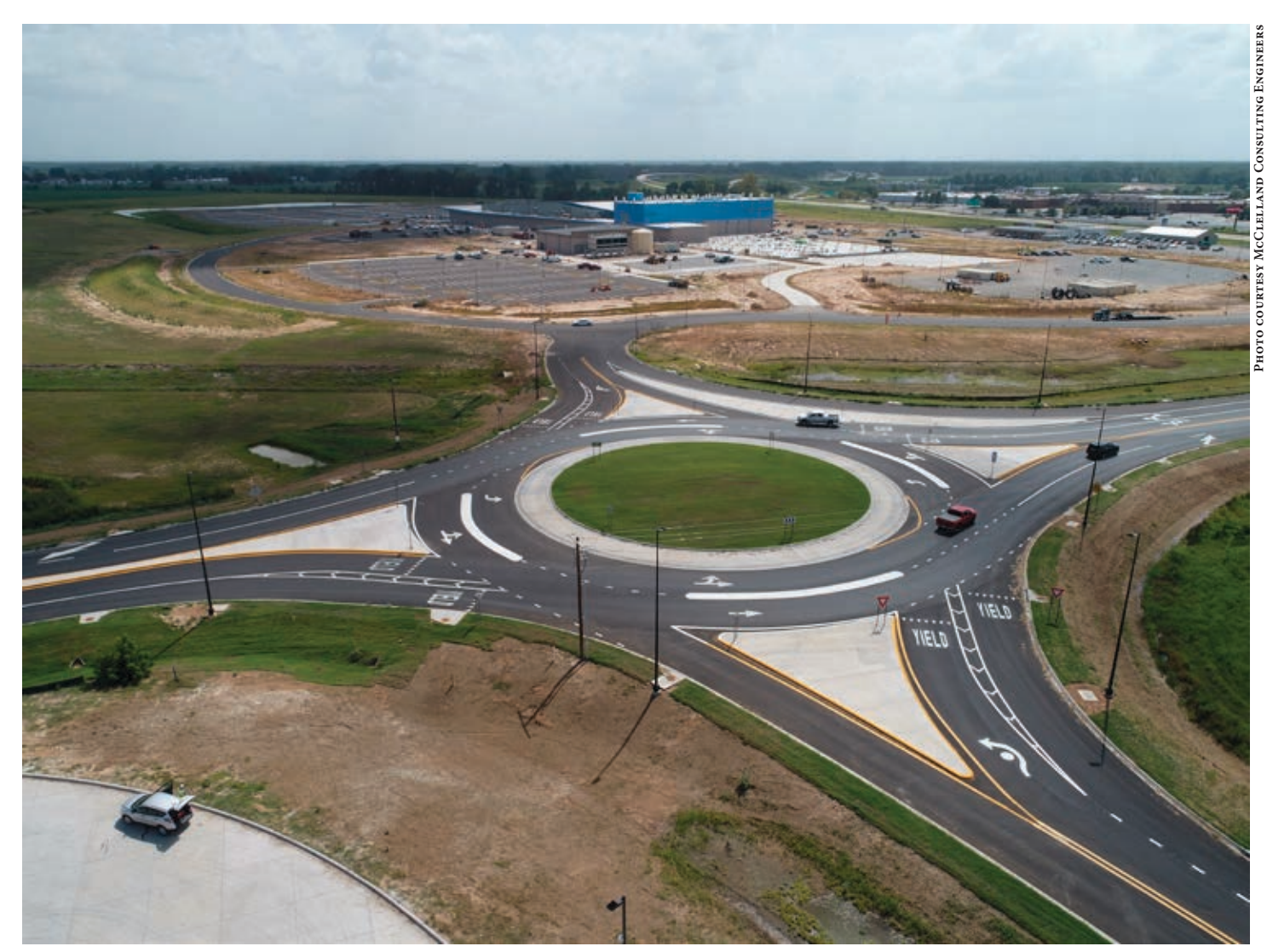
Would a roundabout, like this one in West Memphis, provide the traffic-calming results you desire? A traffic study can help find the answer.