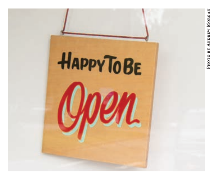
Recruiting retail is essential to building a stronger, more diverse local economy while improving quality of life and place.

Know your market. Identify your assets and positive attributes and communicate them effectively. Familiarize yourself with the language that national retailers speak. They want to know specifics: your population numbers, the traffic count in specific areas of town throughout the day, and household income.